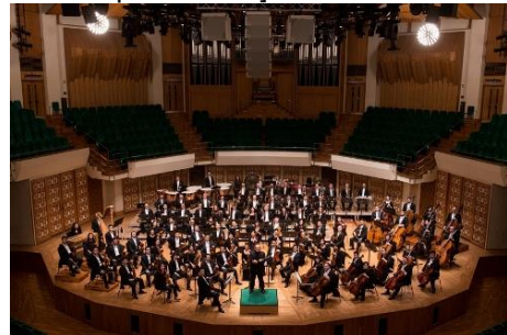
The Hong Kong Philharmonic Orchestra