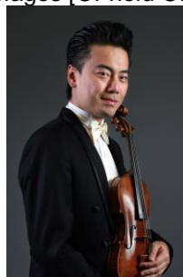
Jing Wang