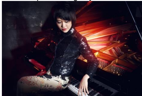
Yuja Wang