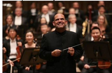
The Hong Kong Philharmonic Orchestra