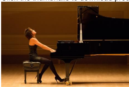
Yuja Wang

Click the thumbnails to download press images [Or hold Ctrl then click to open the file]