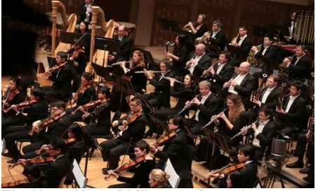
The Hong Kong Philharmonic Orchestra