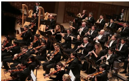
The Hong Kong Philharmonic Orchestra