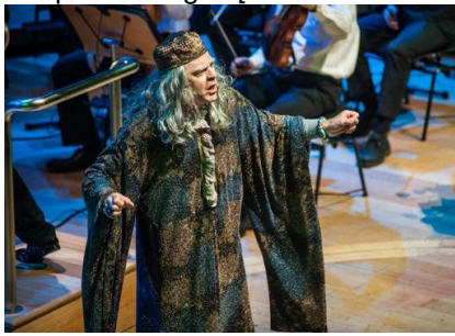
Symphony Sorcery – The Music of Harry Potter