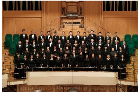
Hong Kong Philharmonic Chorus