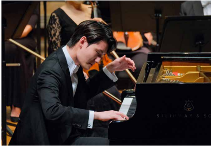
鋼琴家牛牛 Pianist Niu Niu