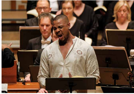
低男中音提內斯 Bass-baritone Davóne Tines