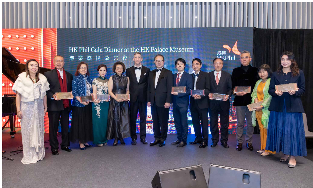
香港管弦樂團慈善晚宴「港樂悠揚故宮夜」HK Phil Gala Dinner at the Hong Kong Palace Museum