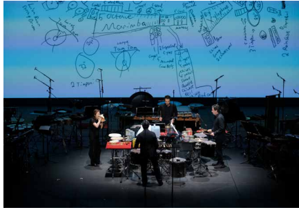
港樂@自由空間：譚盾 | 六月雪 HK Phil @ Freespace: Tan Dun | Snow in June