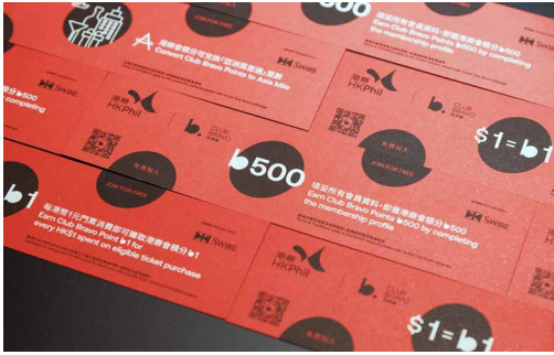
港樂會員獎賞計劃港樂會於2023年以全新面貌示人 HK Phil audience loyalty programme Club Bravo was restructured in 2023

時，全新港樂會網站讓會員掃描音樂會門票以賺取積分。觀眾可以使用積分按個人喜好兌換音樂會門票、合作夥伴獎賞及航空公司里程等。新計劃推出後迅速獲得觀眾支持，在推出後首七周內錄得200萬積分，新會員數目在首月錄得20%增長。