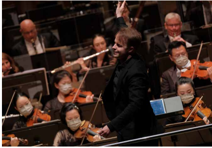
指揮柯蘭瑯 Conductor Taavi Oramo