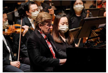
鋼琴家蒂博代 Pianist Jean-Yves Thibaudet