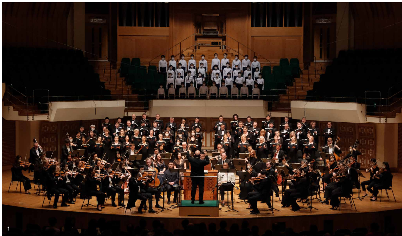
1 | 音樂總監梵志登指揮巴赫《馬太受難曲》 Music Director Jaap van Zweden conducting Bach's St Matthew Passion