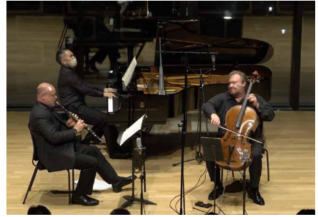
港樂 × 大館：室樂音樂會系列：三人行 HK Phil × Tai Kwun: Chamber Music Series: Trio Rendezvous