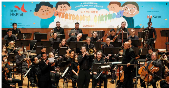
太古社區音樂會：人人生日音樂會 Swire Community Concert: Everybody's Birthday Concert