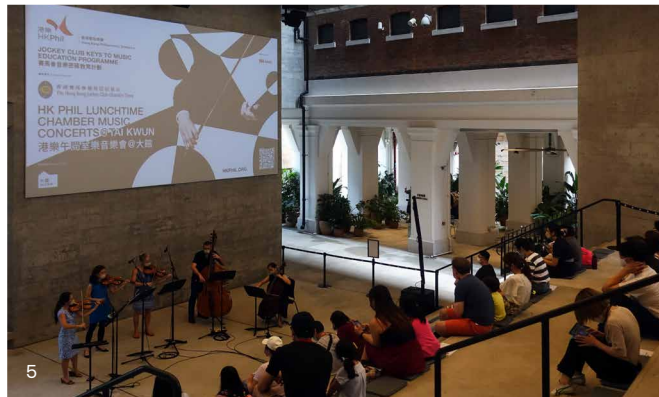
| 3 | 港樂與桃花源粵劇工作坊攜手呈獻啟發自《帝女花》的大型管弦樂作品 In collaboration with Utopia Cantonese Opera Workshop, the HK Phil presented the brand-new orchestral re-imagining of the classic Floral Princess | 4 | 港樂獲香港科技大學邀請於都會音樂節演出 The HK Phil was invited by the Hong Kong University of Science and Technology to perform at the Cosmopolis Festival | 5 | 港樂於大館洗衣場石階舉辦室樂音樂會 HK Phil chamber music concert at Tai Kwun's Laundry Steps