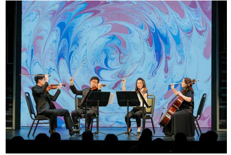
茶館室樂系列：香港管弦樂團：旅人心弦 Tea House Chamber Music Series: HK Phil: Musical Postcards