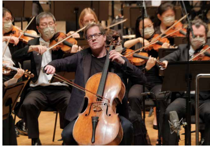
大提琴家霍格勒 Cellist Jan Vogler