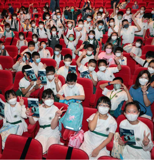
《羅密歐與茱麗葉》主題的學校專場音樂會 School concert with a Romeo & Juliet theme