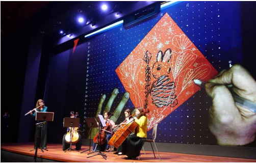
港樂樂師在新開幕的香港故宮文化博物館演出 HK Phil musicians performing at the newly open Hong Kong Palace Museum