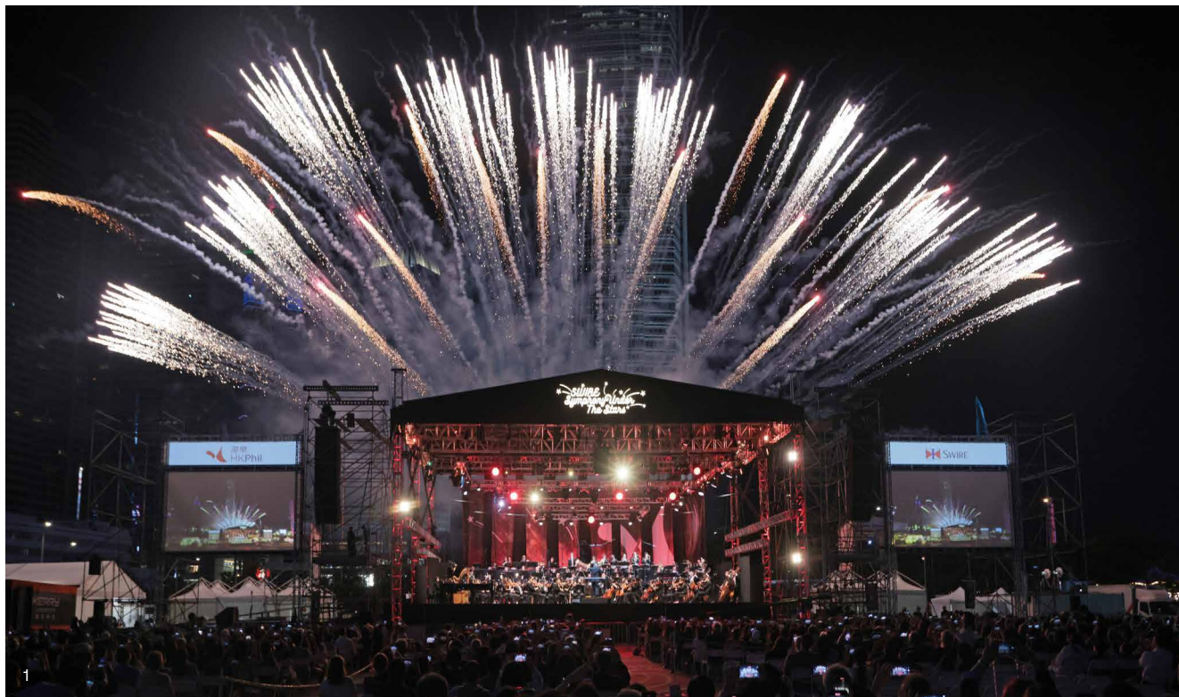
| 1 | 太古「港樂·星夜·交響曲」載譽重臨中環海濱 Swire Symphony Under The Stars returned live to the Central Harbourfront

The HK Phil's free annual outdoor mega-concert took place in November 2022. The live performance was simultaneously streamed on various online platforms.