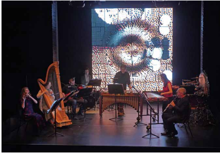
茶館室樂系列：香港管弦樂團：遙聽夜鶯 Tea House Chamber Music Series: HK Phil: Nightingale in Distance