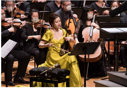
二胡演奏家陸鞅文 Erhu player Yiwen Lu