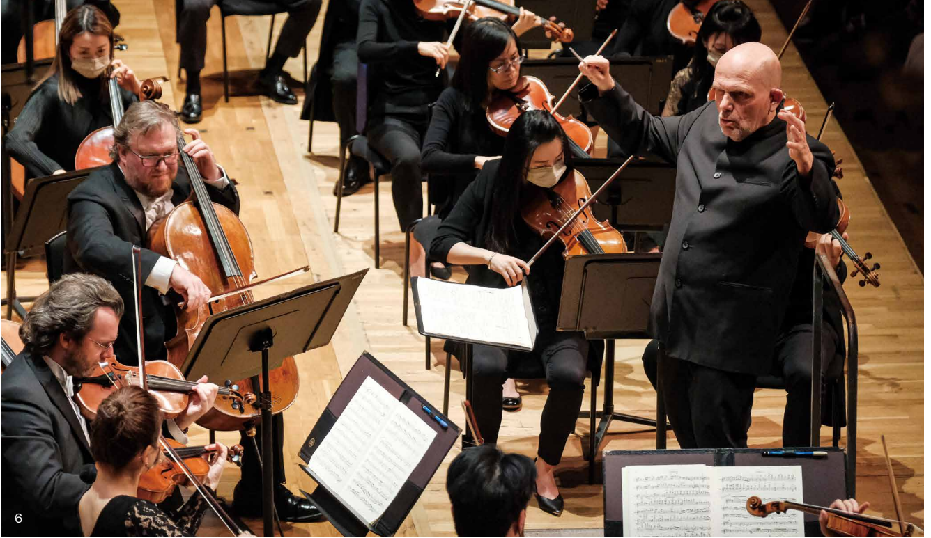
| 6 | 梵志登帶領港樂演出布拉姆斯全套交響曲 Jaap van Zweden leading the HK Phil to perform the complete Brahms Symphony cycle