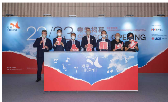
2022/23 樂季揭幕典禮 2022/23 Season Opening Ceremony