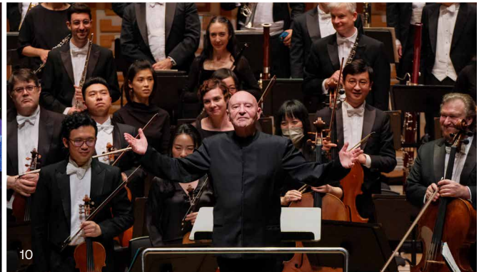
| 7 | 基特寶演奏蒲羅哥菲夫第三鋼琴協奏曲 Boris Giltburg playing Prokofiev's Piano Concerto no. 3 | 8 | 陳銳拉奏孟德爾遜小提琴協奏曲 Ray Chen playing Mendelssohn's Violin Concerto | 9 | 「阿爾卑斯——交響曲再想像」音樂會配以壯觀的影像放映 The concert "An Alpine Symphony in Images" was presented with screening projection | 10 | 艾遜巴赫指揮了布魯赫納第四交響曲 Christoph Eschenbach conducted Bruckner's Symphony no. 4