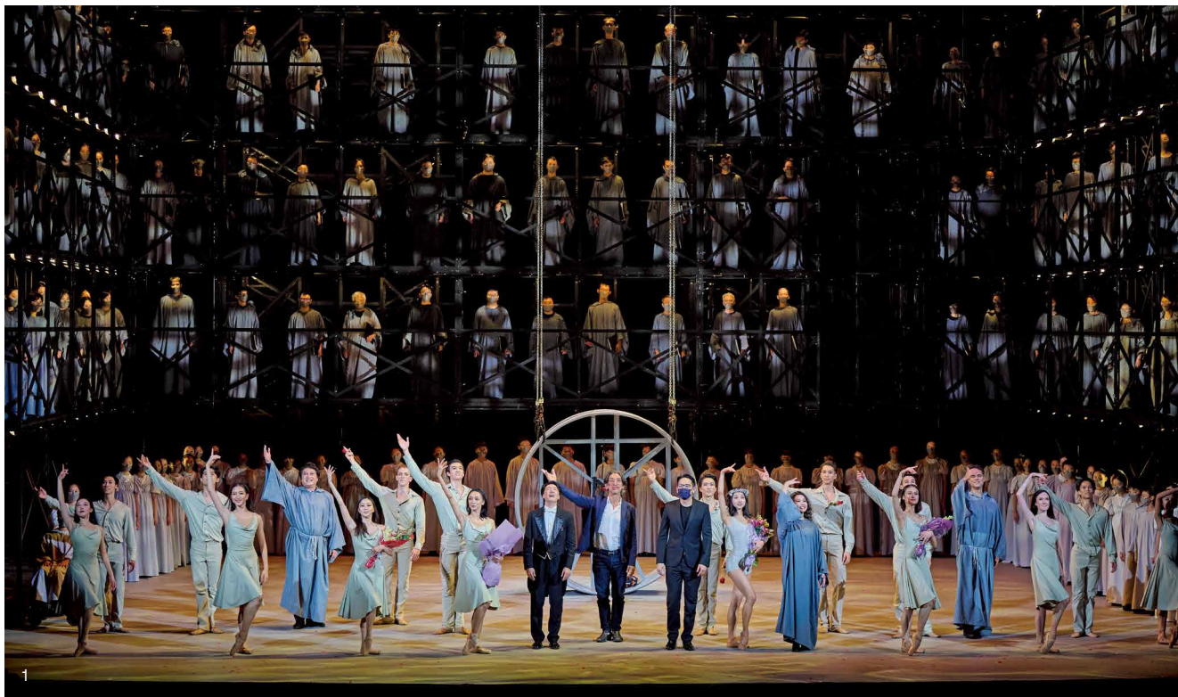
| 1 | & | 2 | 港樂與香港芭蕾舞團聯合呈獻經典舞劇《布蘭詩歌》The HK Phil and Hong Kong Ballet co-presented Carl Orff's iconic Carmina Burana

The HK Phil continues its audience building efforts through collaborations with different organisations, presenting a variety of programmes of chamber music and full orchestral works.