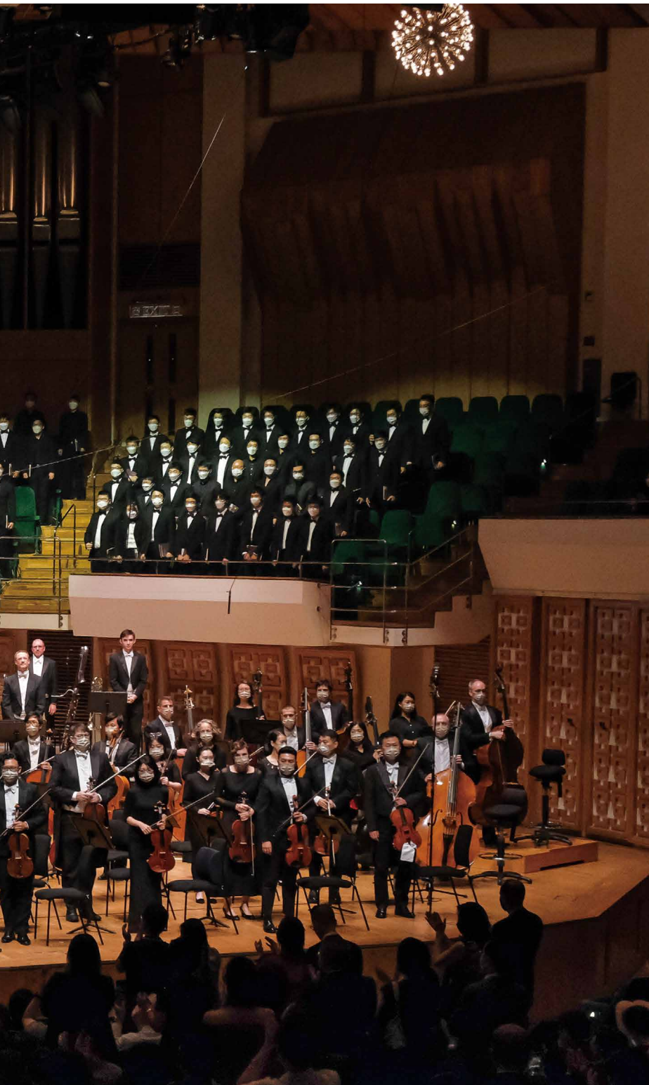
樂季揭幕：梵志登 | 貝九 Season Opening: Jaap | Beethoven 9