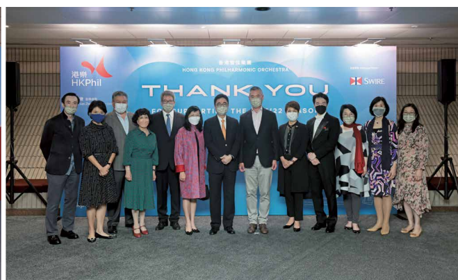
酬謝贊助人音樂會 Donor's Thank You Concert