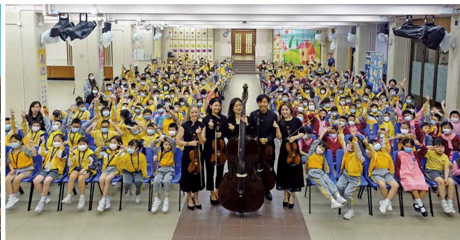
室樂小組到校表演 Ensemble Visit