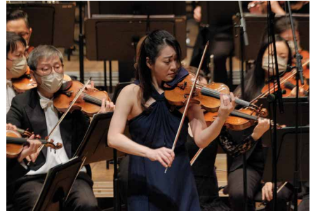
小提琴家諏訪內晶子 Violinist Akiko Suwanai