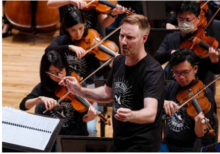
指揮羅菲 Conductor Benjamin Northey