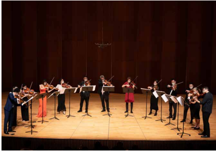
港樂 × 港大繆思樂季：聚焦管弦：中提琴 HK Phil × HKU Muse: Orchestral Spotlights: Viola