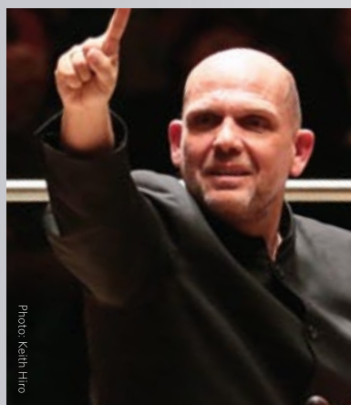
梵志登 Jaap van Zweden

Join one of the world's great violinists, Frank Peter Zimmermann, for a night of awe-inspiring music. Sibelius's violin concerto is a dreamlike work which makes supreme demands on its soloist. Against its sharp contrasts of mood, Jaap van Zweden presents the triumphant mood of Prokofiev's fifth symphony – a work composed on the eve of allied victory in World War II.