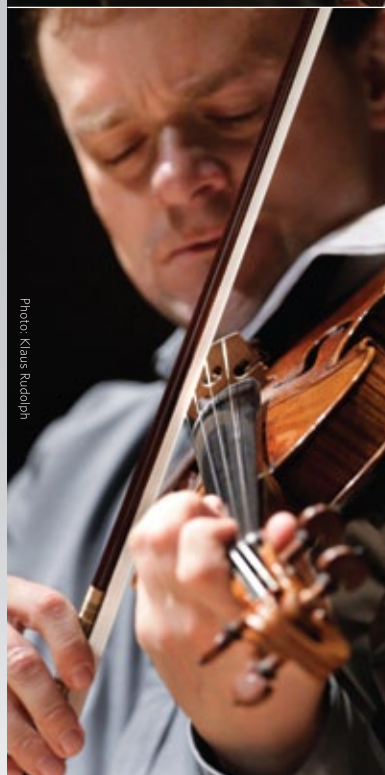
齊默曼 Frank Peter Zimmermann