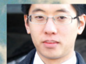
林丰 Fung Lam 作曲家 composer

隨着2008年管弦樂曲《解》由BBC音樂會樂團首演，林丰不但成為首位獲BBC委約創作的香港作曲家，更成為BBC史上委約創作的最年輕華人作曲家。他的最新管弦樂作品《融》是由港樂委約創作的，首演於2010年9月在上海世界博覽會由艾度·迪華特指揮。他的作品曾被倫敦交響樂團、BBC愛樂、新西蘭交響樂團、香港節日管樂團演奏。