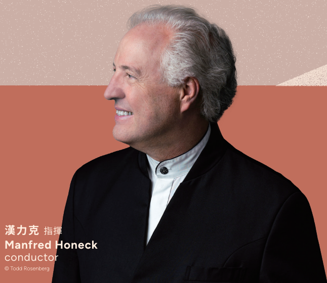
漢力克 指揮 Manfred Honeck conductor