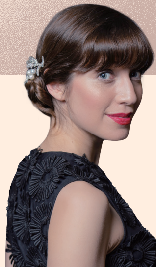
湯瑪斯 大提琴 Camille Thomas cello